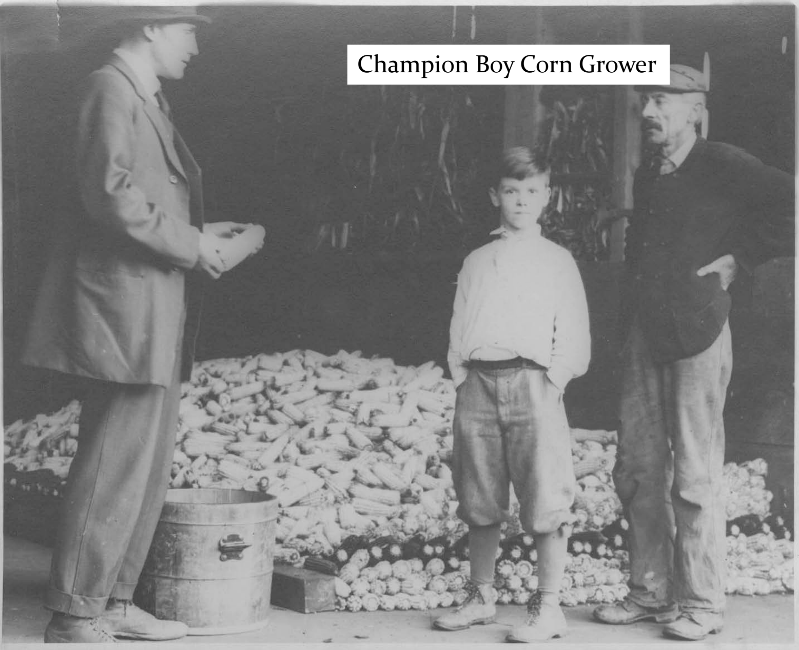
CHAMPION BOY CORN-GROWER OF HIS COUNTY