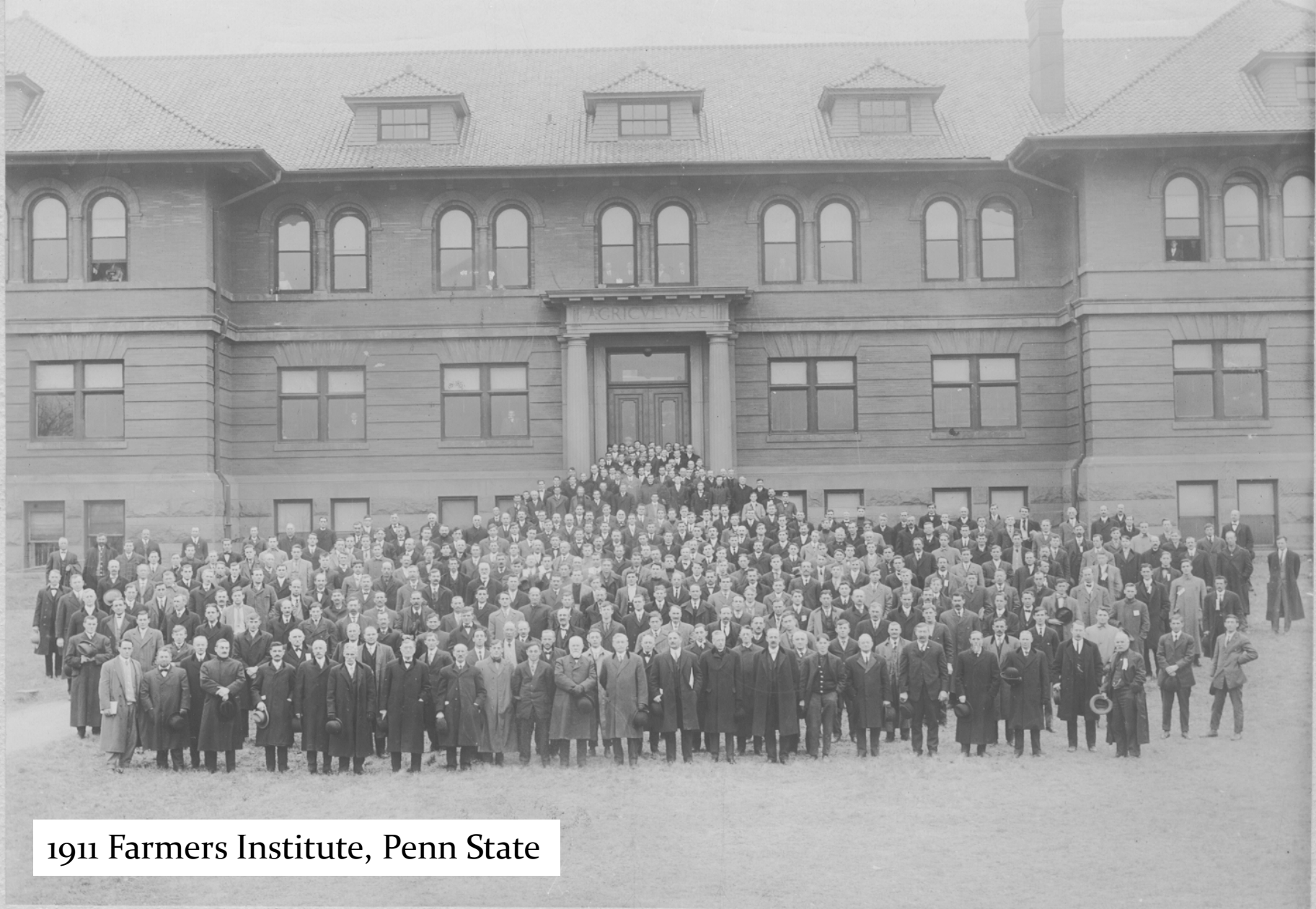
1911 Farmers Institute, Penn State