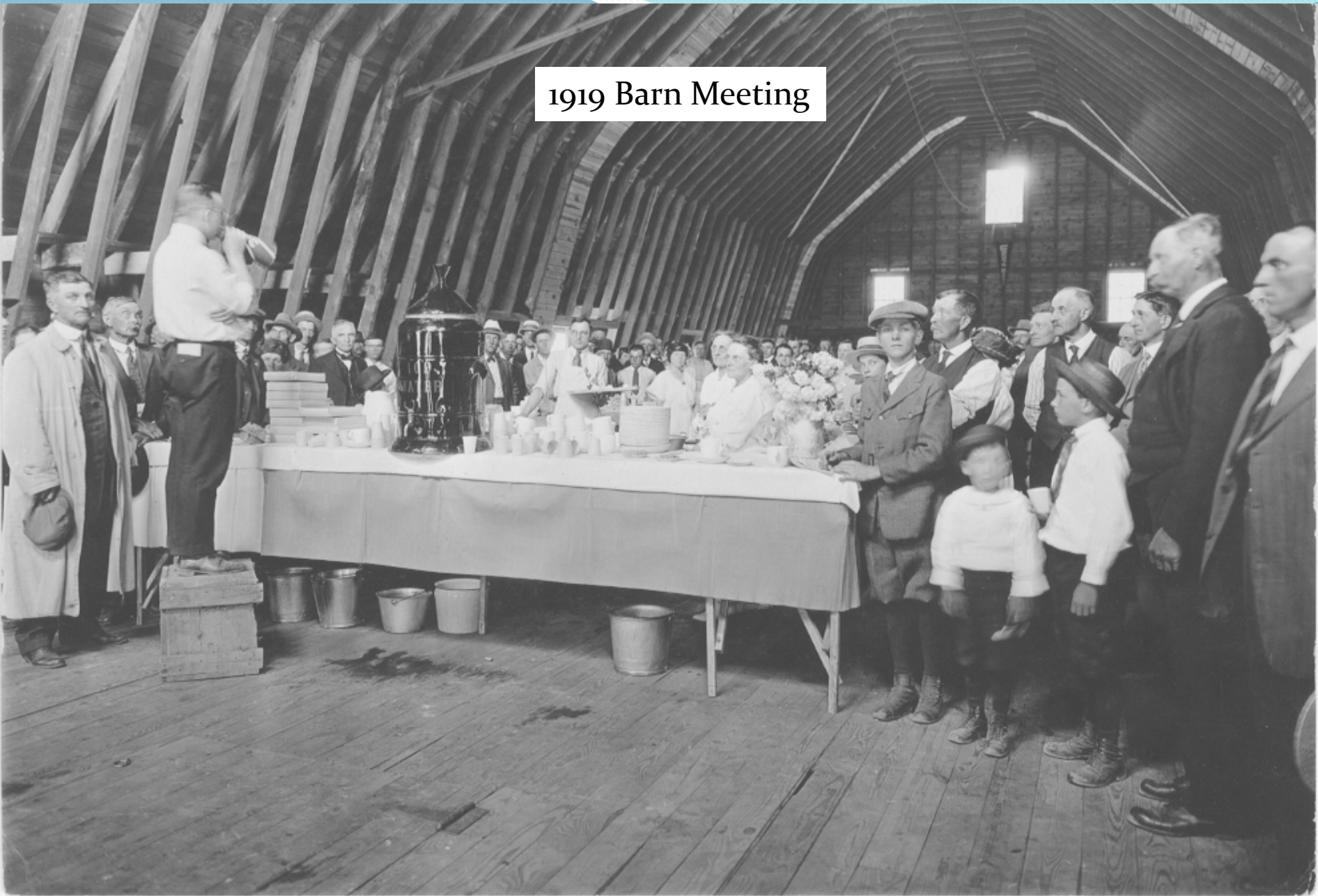
1919 Barn Meeting