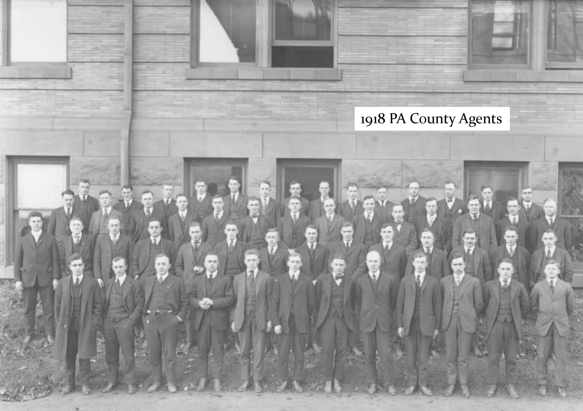
1918 PA County Agents