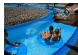
The lazy river at Wild Water West

For more information on the Sons and Daughters activities, visit the AM/PIC website: agagents.wordpress.com