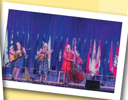
A stirring evening of performances by 4-H youth from Arkansas, Tennessee, and Georgia.