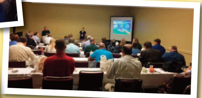
Seminar time!