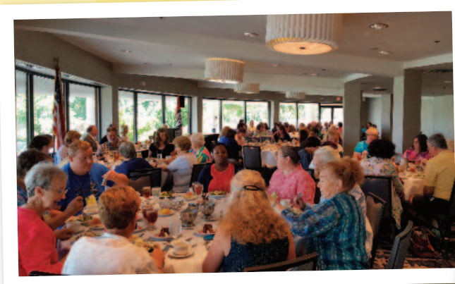
Spouses of ag agents enjoying lunch.