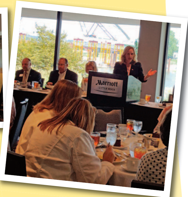
Arkansas Attorney General Leslie Rutledge keynotes a lunch for ag agent spouses.