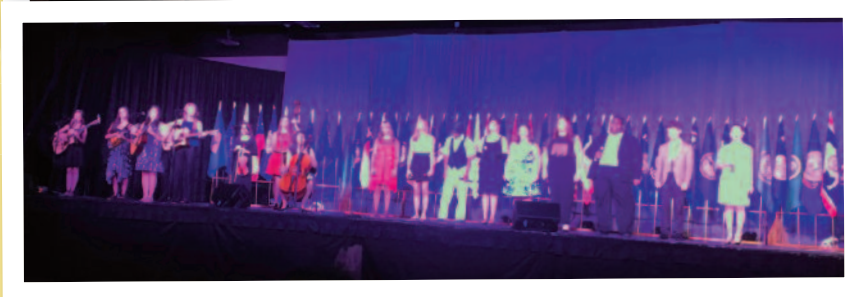
Grand finale.