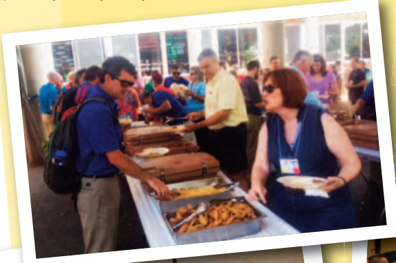
In line for the catfish dinner.