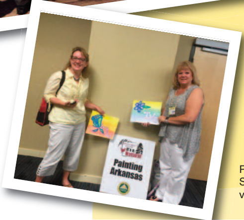
Painting projects from spouse events.