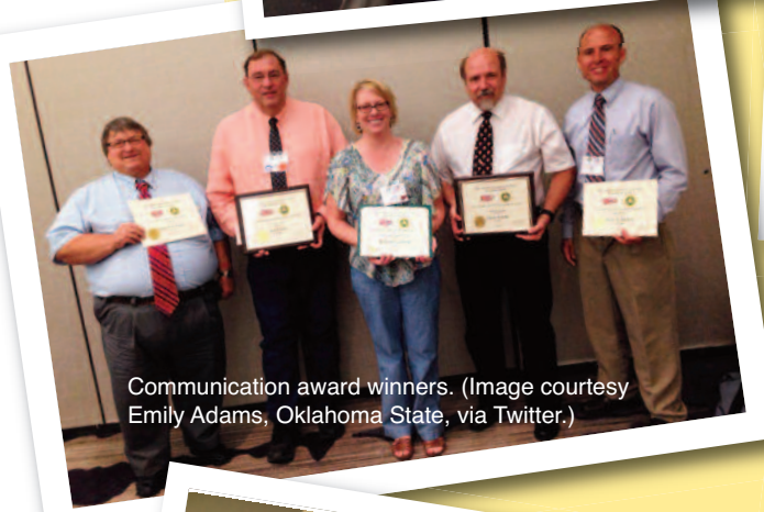
Communication award winners.