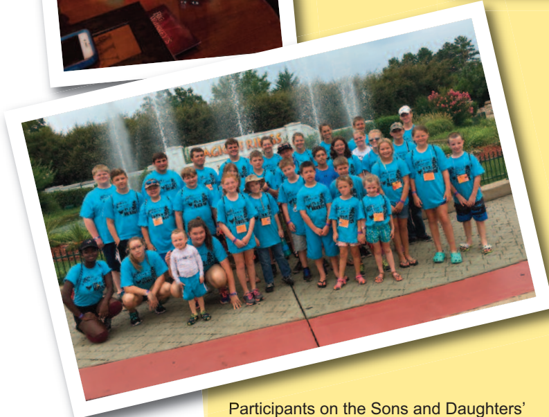
Participants on the Sons and Daughters' tour at Magic Springs water/amusement park.