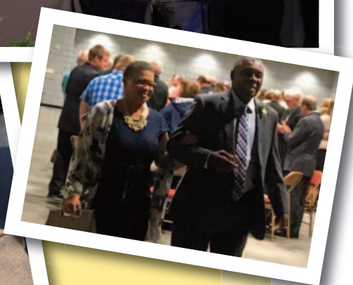
Above, scenes from the DSA banquet.