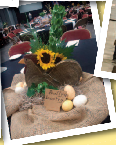
Table setting at Farewell Banquet