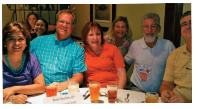
States' Night Out at Cajun's Wharf