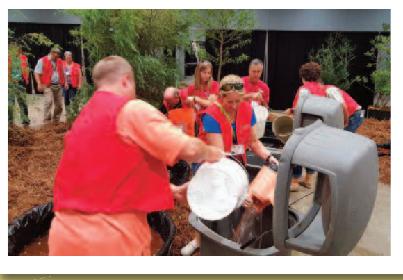
Arkansas agents tearing down booth.