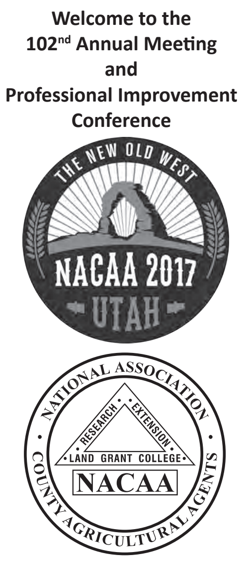
National Association of County Agricultural Agents