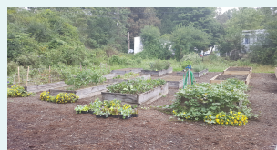
Free Clinics Community Garden serves low income clientele.