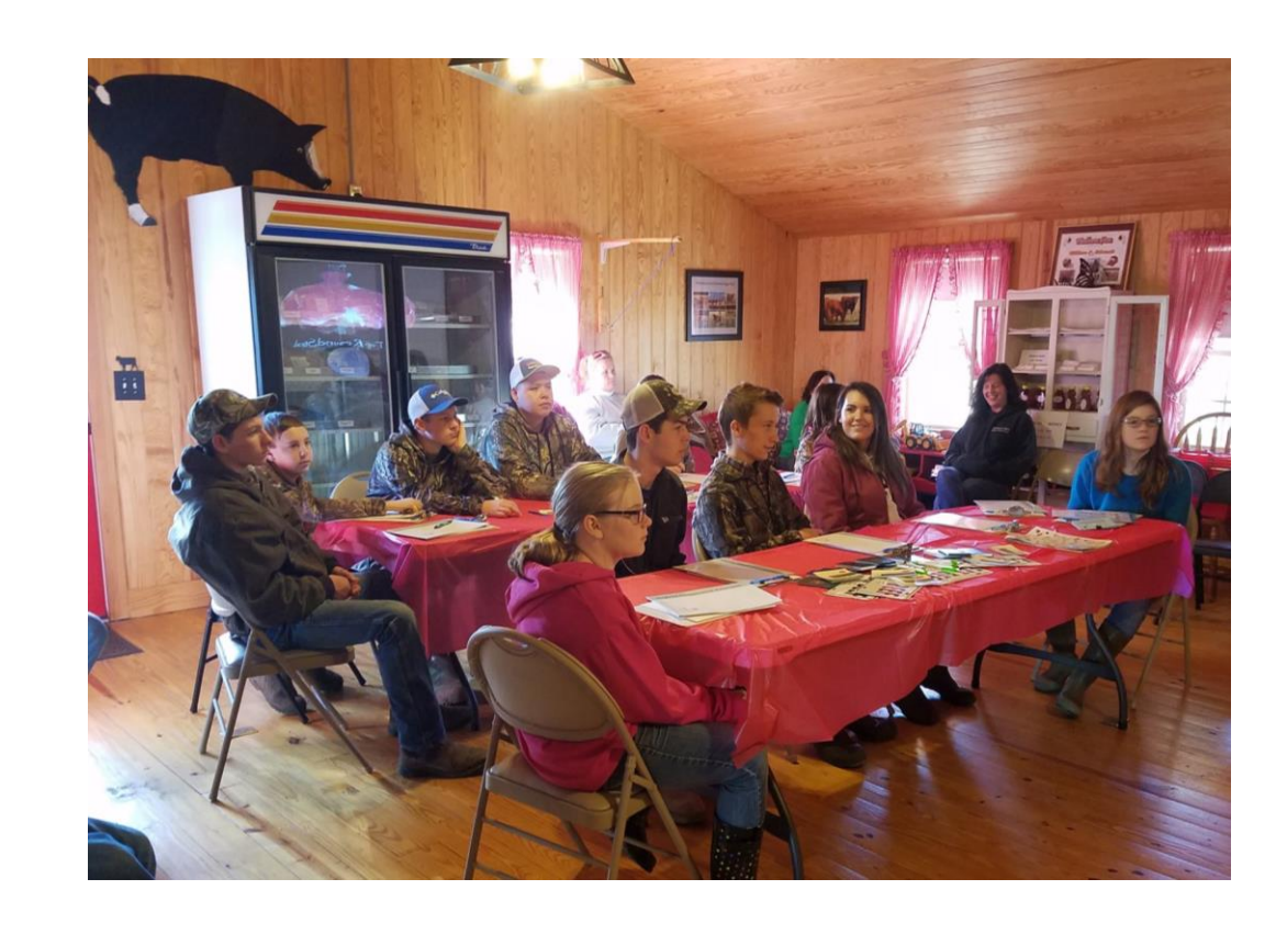
Agritourism examples: Top Picture- Sensory bin at a farm field trip. Bottom picture- Meat educational workshop at a local farm market.