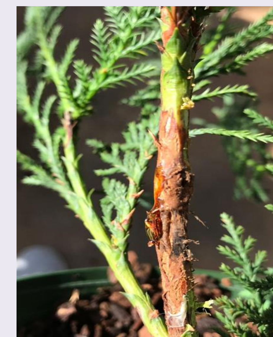
Figure 3. Inoculated Leyland cypress stem six weeks after inoculation. Sap oozing and stem discoloration beyond the wound site is evident.