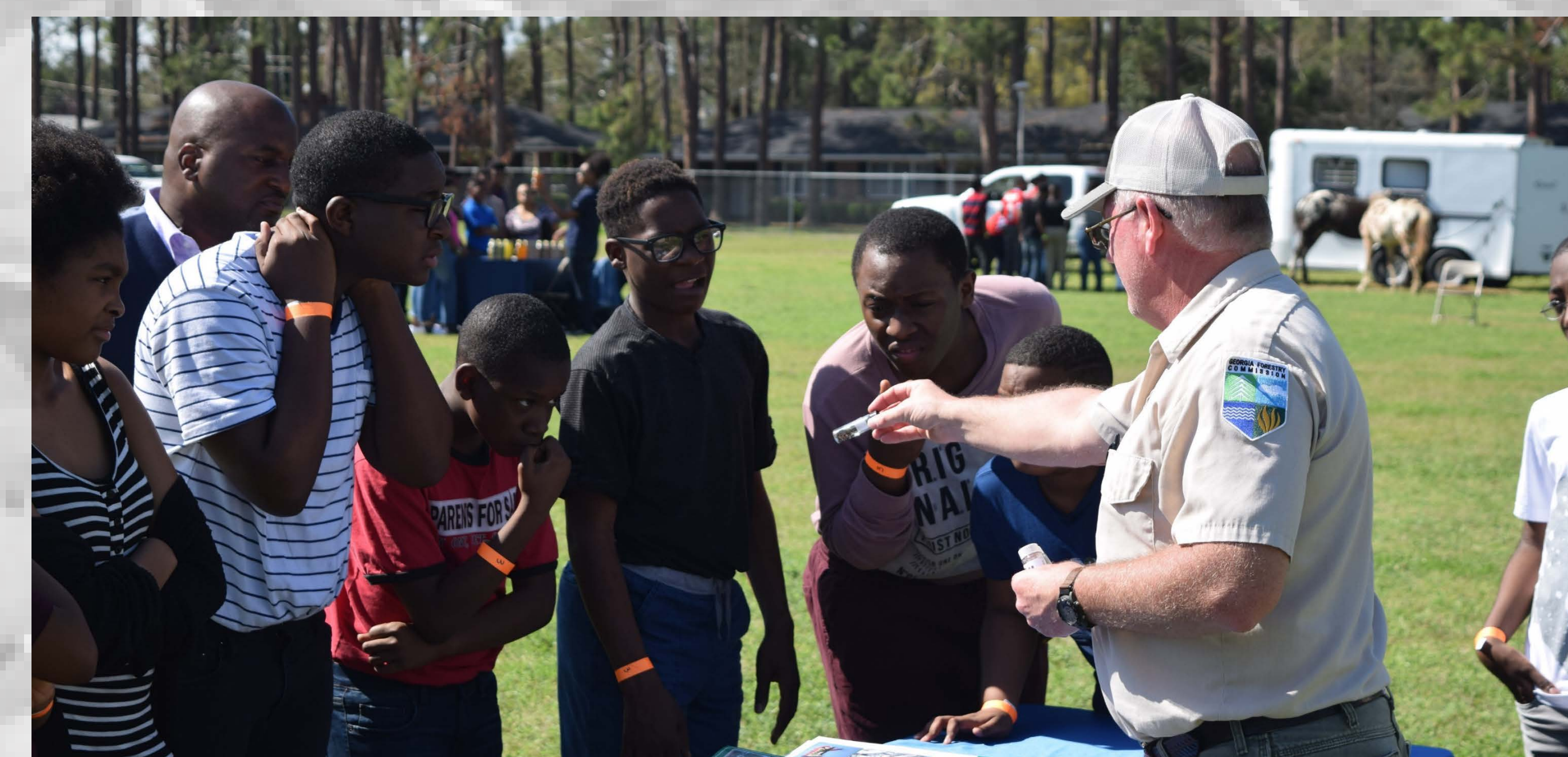
Figure 6: Georgia forester shows students forestry related insects

Question 1: 82% of participants were able to name a career related to agriculture other than "farmer". Question 2: 91% of students also reported knowing how much money the agricultural industry contributes to Georgia's economy. Question 3: 73% of participants stated they would be interested in an Agricultural Pathway at the middle or high school level. Question 4: 86% of the students surveyed were able to recall the top 5 agricultural commodities.