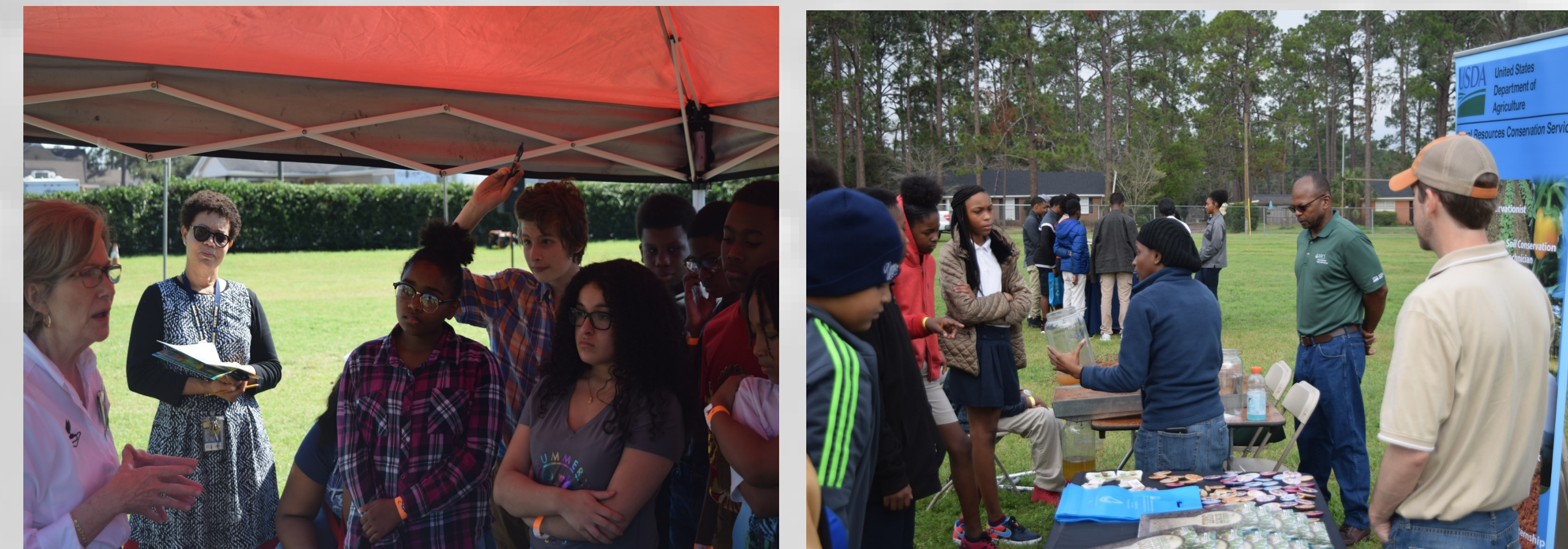
Figure 2 & 3: SOWEGA Master Gardeners and USDA NRCS joined the group of exhibitors for the field day