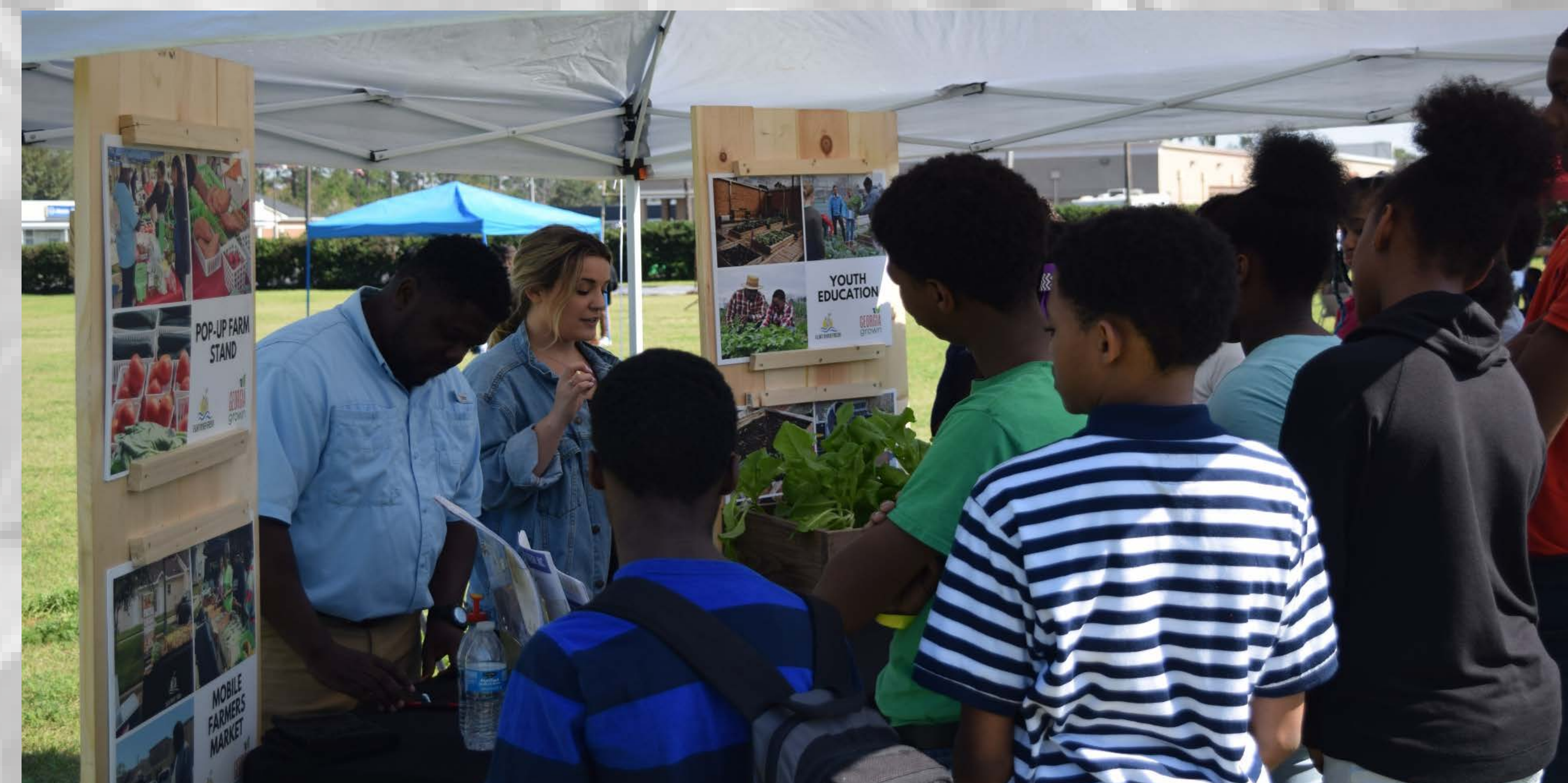
Figure 4: Students gather at the Flint River Fresh station

When talking to kids in urban area about careers in agriculture, farmers are the first thing that comes to mind. The goal of the Dougherty County Agricultural Field Day was to educate students in five agricultural fields of study. These areas included Agricultural Business, Horticulture, Environmental Education and Natural Resources, Crop Production and Animal Science. Five representatives per field of study were identified. Each representative was sent an Ag Field Day flyer and vendor form to complete and confirm their attendance. The 4-H Agent developed a pre/post-test that was given out to the students at the beginning of each assembly and then again after they visited their last station. The CTAE director handled the logistics of providing tables and chairs for each station, soliciting volunteers, assigning each of the four middle schools times in which to participate in the field day, arranging lunch and transportation to Merry Acres Middle School where the Ag Field Day took place.