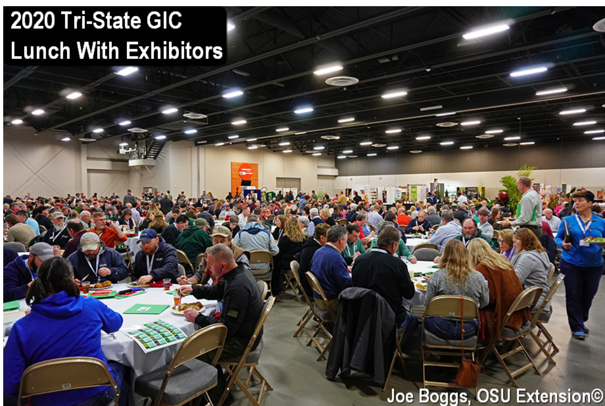
2020 Tri-State GIC Lunch With Exhibitors

Respondents agreed (4.20) new knowledge gained from the Trade Show will be used to make future purchasing decisions