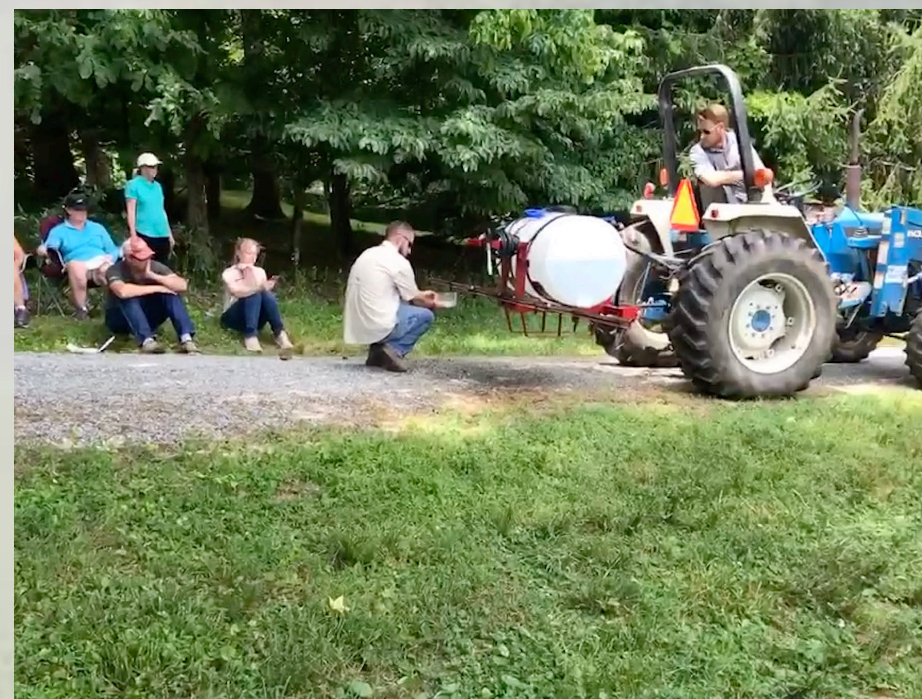
In Station 3 , participants learned how to calibrate a boom sprayer and about proper control of common pasture weeds.