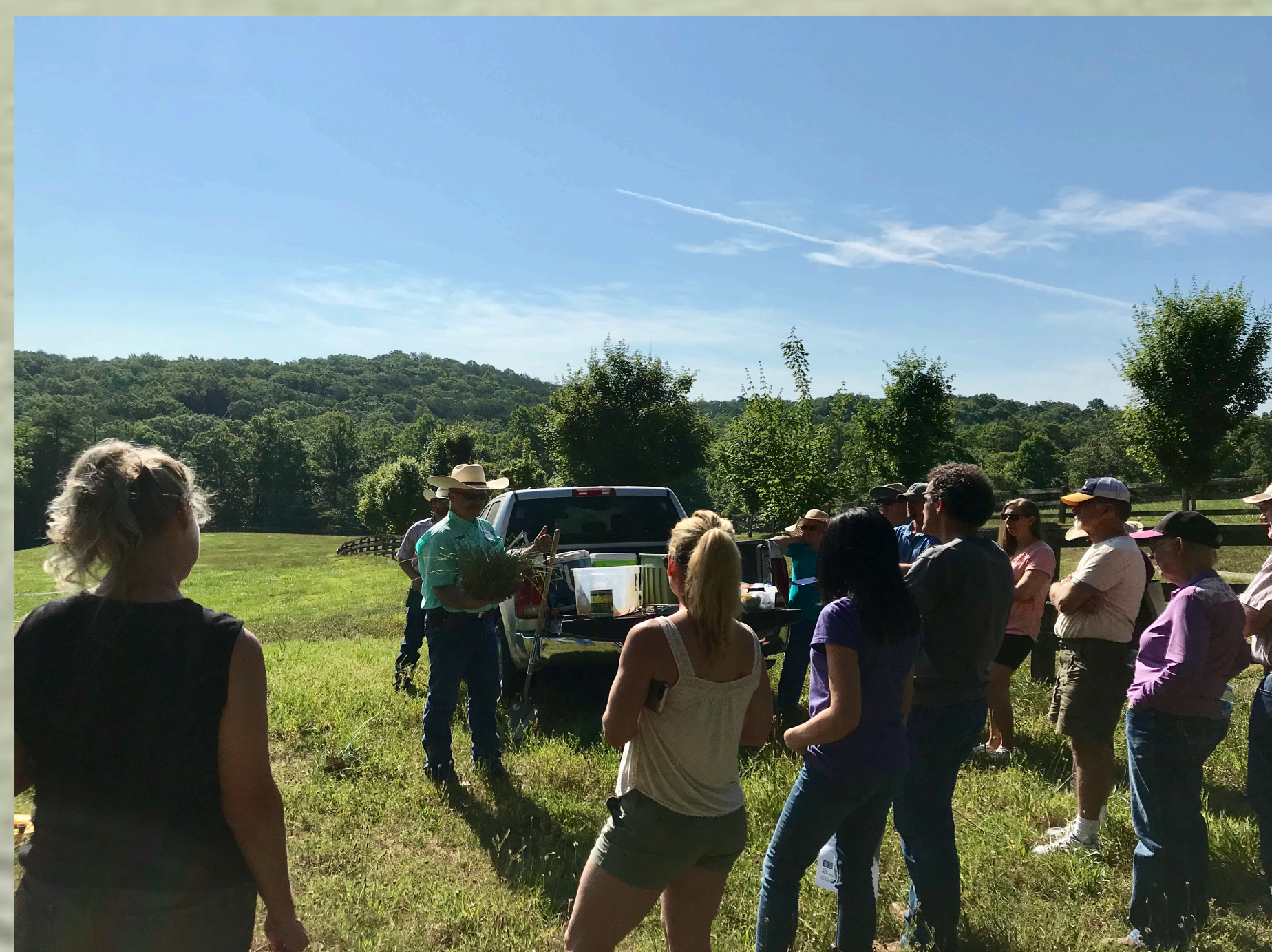
Finally, in Station 4 , participants learned the principles of soil health and were introduced on how to properly use temporary electric fencing to manage grazing and forage use.