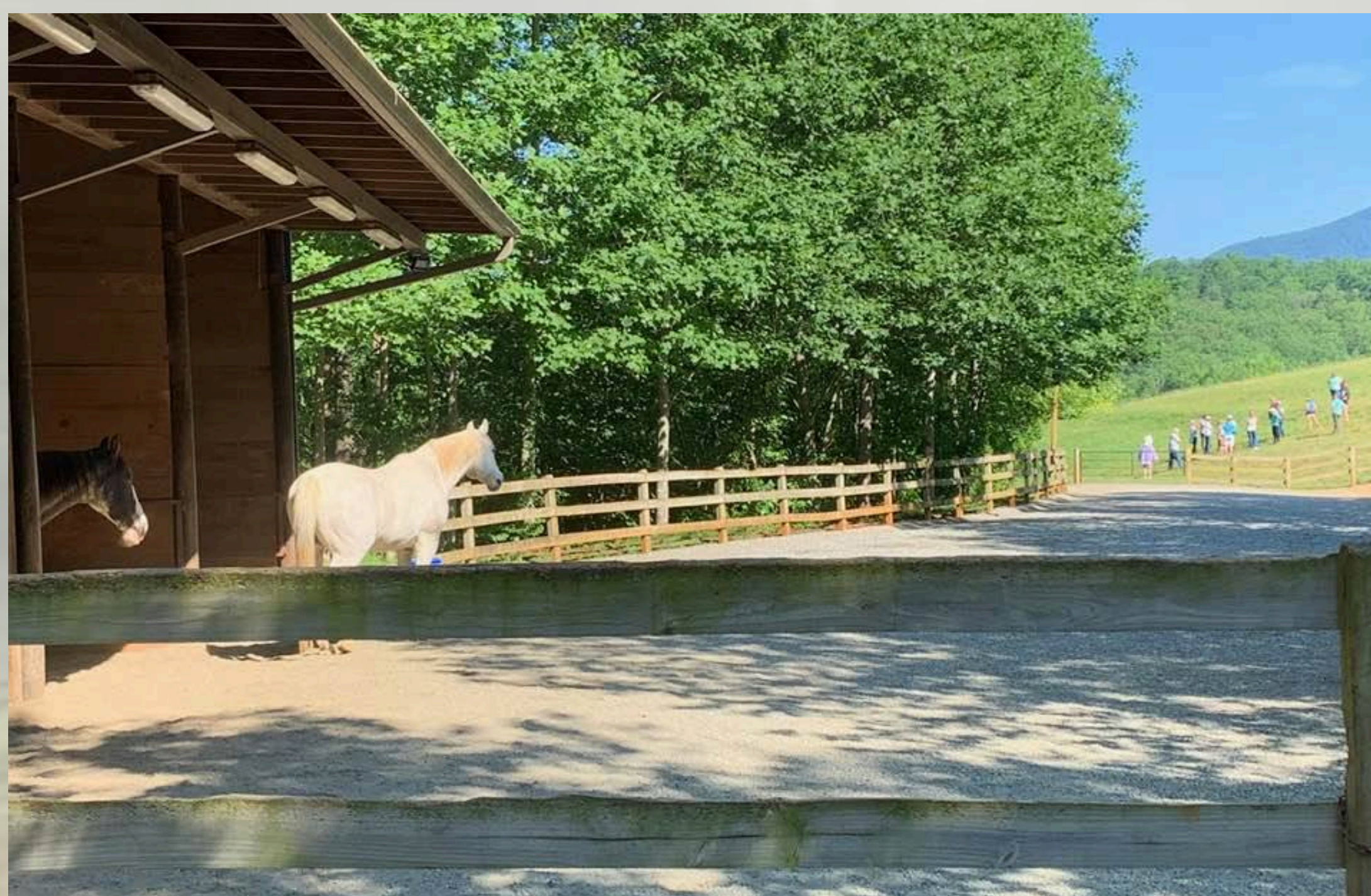
Station 1 taught body condition scoring and methods for forage intake control. Participants learned how to use a weigh tape to estimate energy balance and viewed dry lot designs as a method for managing forage intake and saving pastures during times of adverse growing conditions (i.e., drought, excessive rainfall, etc.) Grazing behavior of horses was also observed and established why managing this behavior is necessary for healthy horse pastures.