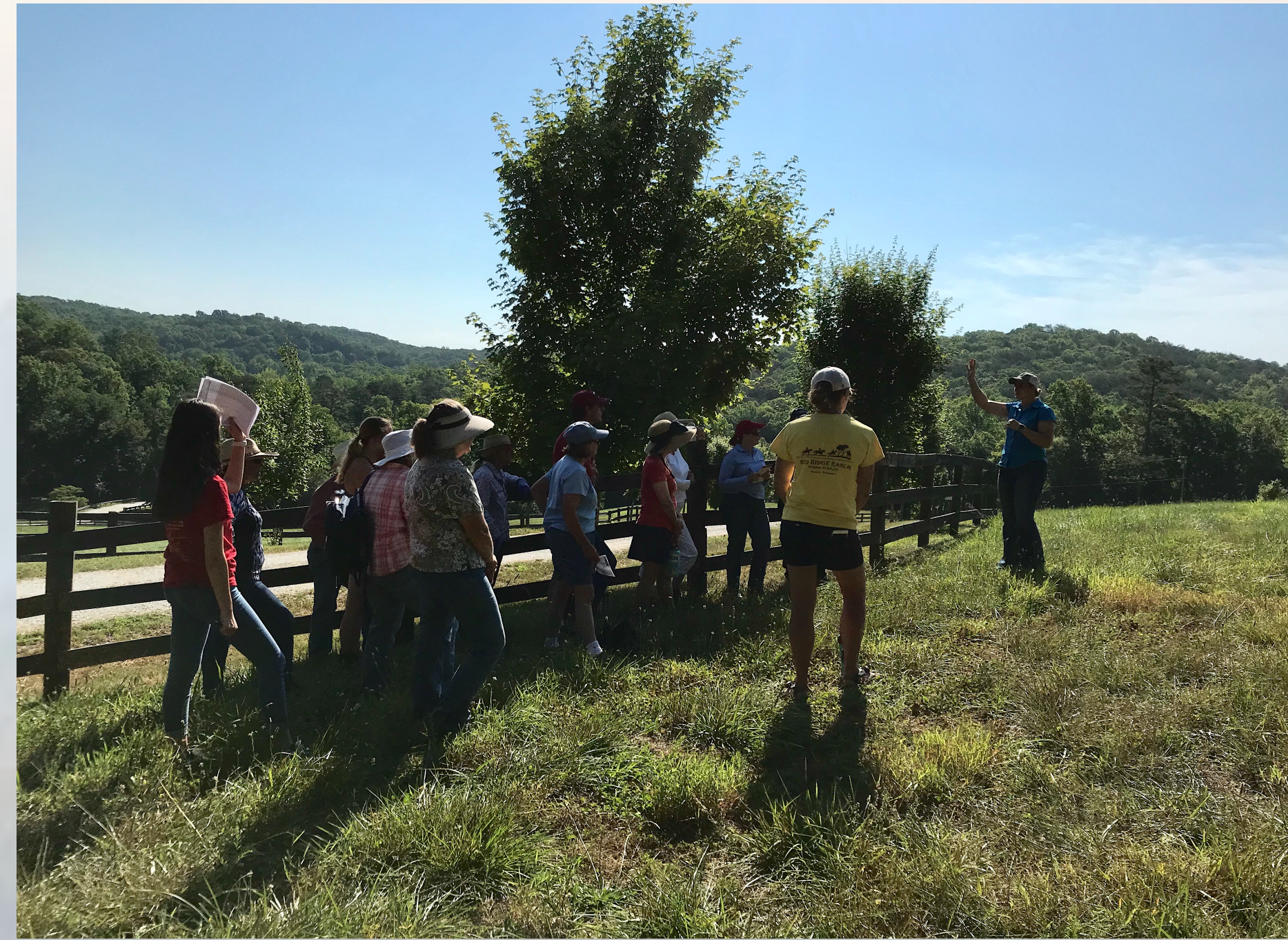
Station 2 viewed common pasture plants for the area, identified weeds, and discussed the best forages to plant for horse pastures in the region.

Extension Agents from Clemson and North Carolina Cooperative Extension partnered to offer a unique interactive pasture management course for the Carolina Foothills area. The 1-d course, held in May 2019 at Cotton Patch Farm, a historic 400 acre horse farm in Tryon, NC, offered a total of 4 h of instruction. Participants were split and rotated between four groups to allow for hands-on opportunities. The stations were designed to walk the workshop attendees through the process of horse pasture management.