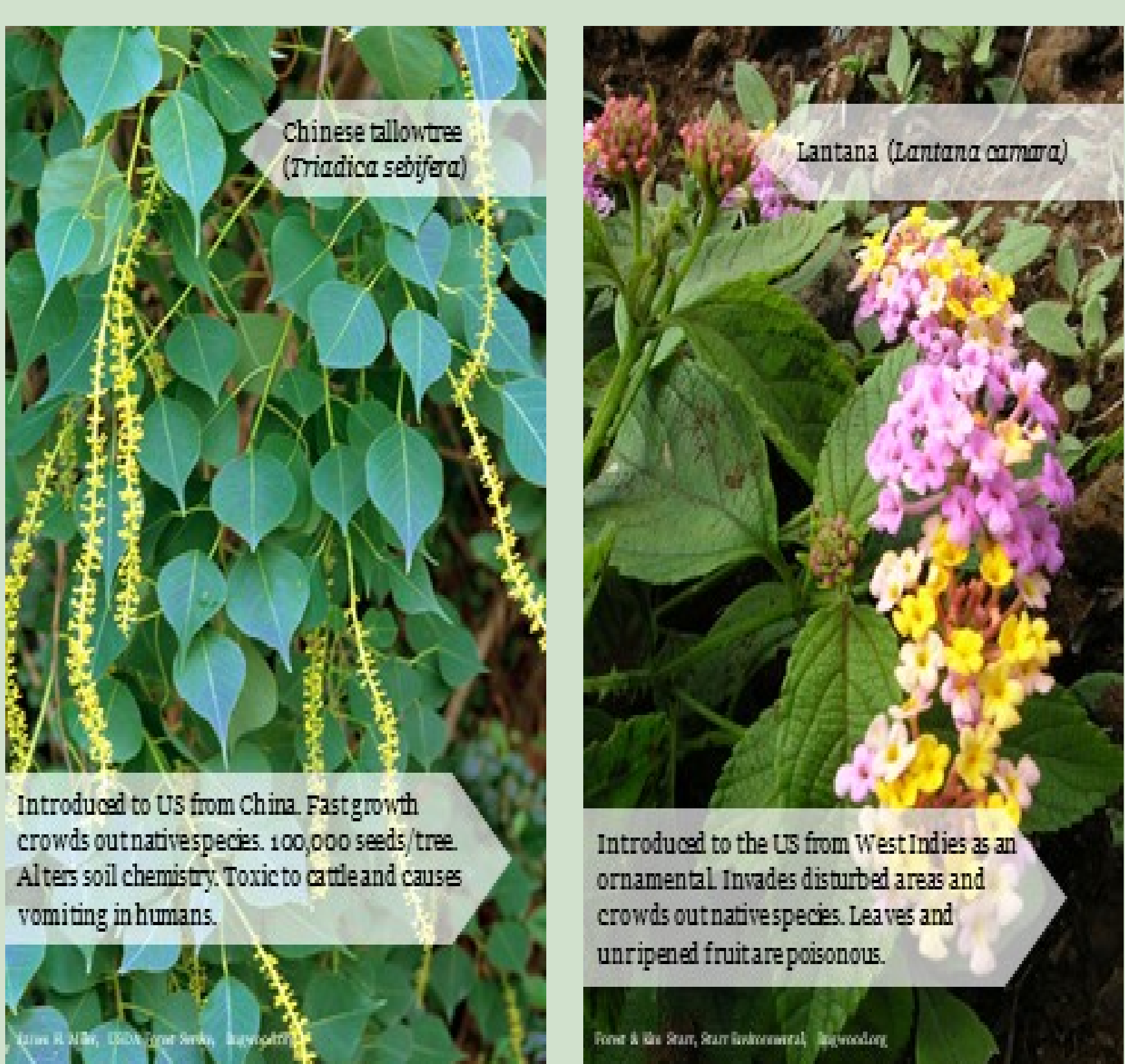
Figure 2: Playing cards. ACE, King, Queen – in order of level of most invasive.