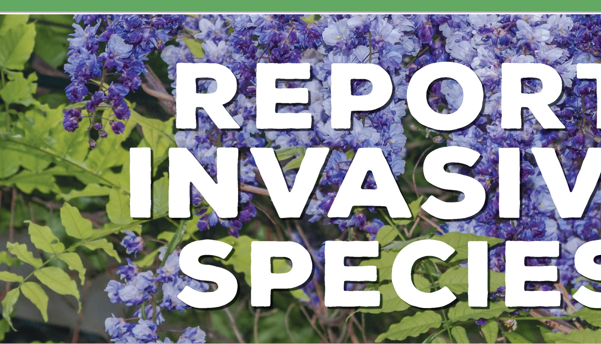
Figure 1: Two Billboards were placed promoting the use of a phone APP to report invasives.