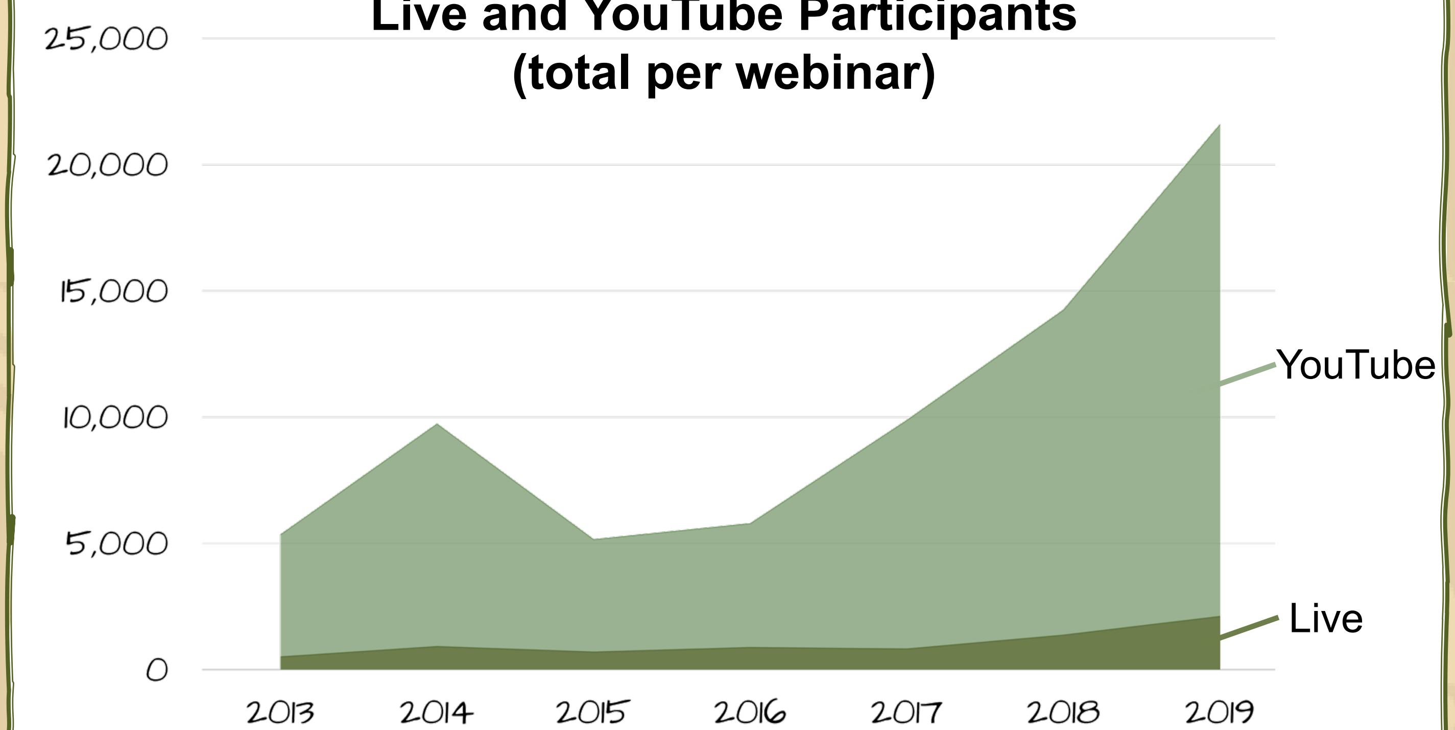
Live and YouTube Participants (total per webinar)

Extension's audience often needs fundamental knowledge of pest identification, biology, and management. This lack of knowledge often leads to the overuse of pesticides, the use of unnecessarily dangerous pesticides and do-it-yourself remedies, and the over expenditure of time, energy, and money to manage pests.