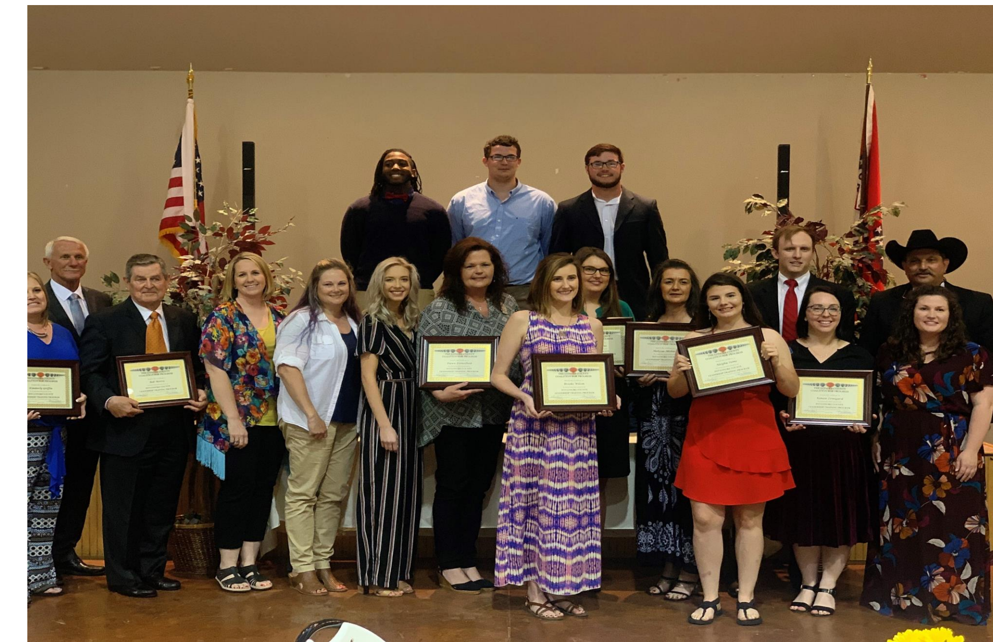
Lonoke Leadership Graduation