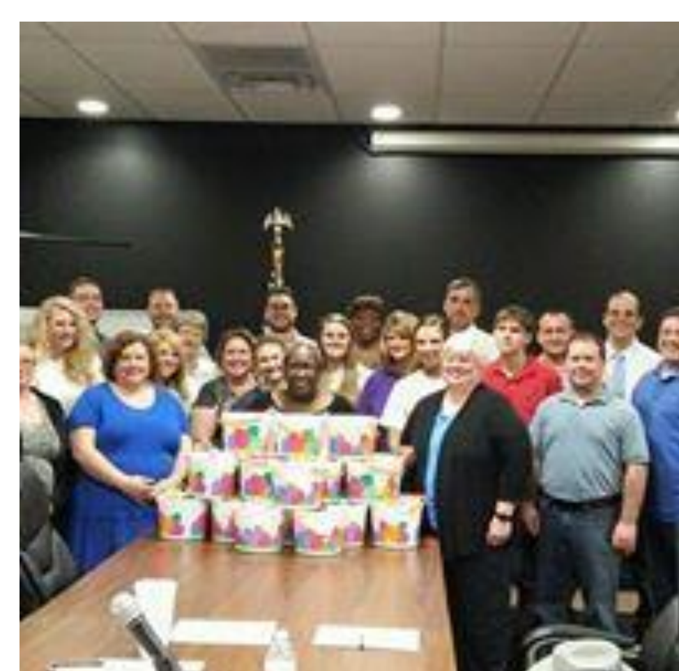
Leadership alumni, donations, presentations and tours.